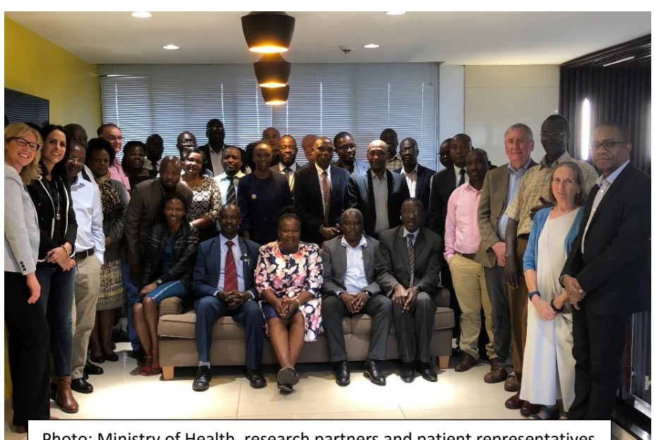
Photo: Ministry of Health, research partners and patient representatives at the International Steering Committee meeting in Entebbe, Dec 2019

EDCTP has agreed to fund a phase 3 trial of metformin in Tanzania. Merck have agreed to supply the products again.